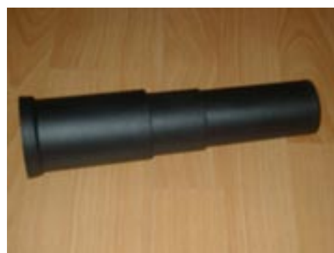
Gas Lift Cover